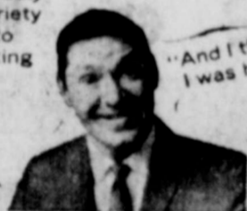
"And I thought I was happy!"

Imagine the comfort of warm circulating air reaching into every corner of your home this winter. That's what you get with modern gas central heating. And only with gas heating. Of course, there's a wide variety of modern, automatic gas heating equipment to take care of any situation—whether you're heating one room, several rooms or your entire home. Call your gas heating contractor or Lone Star Gas for a free estimate—now—during August and September when heating contractors have more time, and are offering savings. Modernize for winter with modern gas heating. SUMMER GAS HEATING SALE