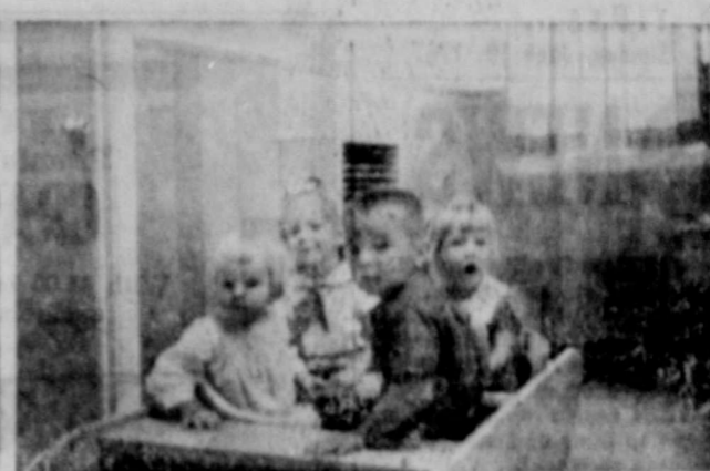
JUST LIKE SCHOOL for four very young pupils of Vacation Bible School at First Baptist Church. Parents Night will be observed at 7:00 p. m. Sunday, June 18.