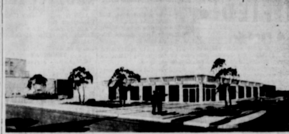
ARCHITECT'S DRAWING OF NEW COMMERCIAL STATE BANK, RANGER