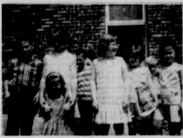
FEW OF MANY children enrolled in Vacation Bible School at Second Baptist Church. Classes will continue through Friday, June 16.