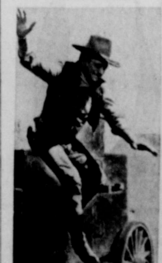
John Wayne jumps from the steel-clad fortress just as it crashes into a gully in the thrilling climax of "The War Wagon," a Universal picture in Technicolor. It is a Batjac presentation of a Marvin Schwartz production.