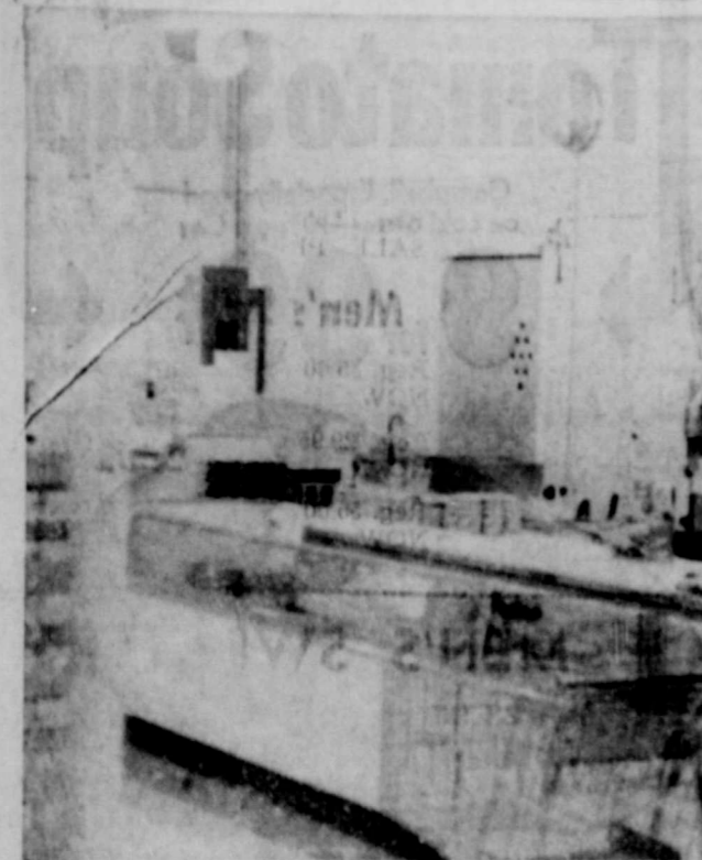
MODERN MARKET — Pictured is JRB's brand new modern meat market where customers will find only the highest quality and best grade meats.