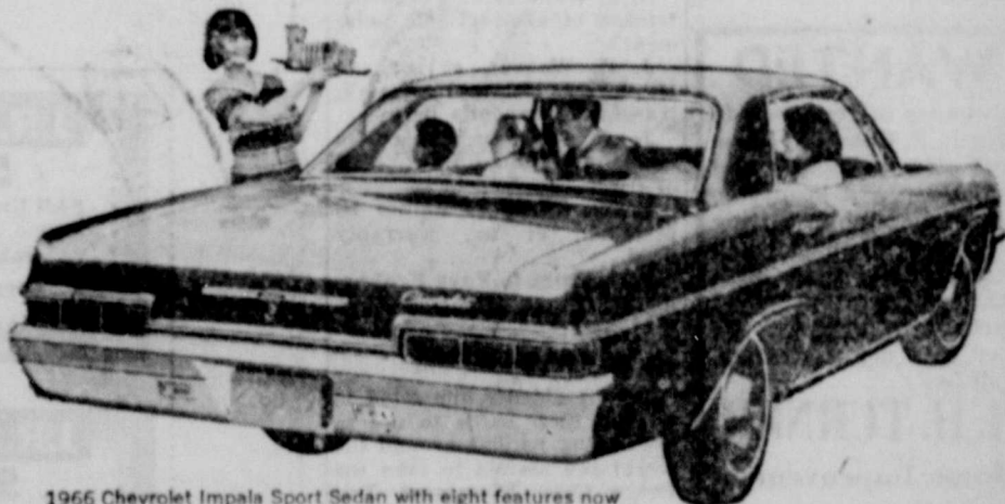
1966 Chevrolet Impala Sport Sedan with eight features now standard for your added safety—including back-up lights and seat belts front and rear (always buckle up!).

What you get is • The meticulous coachwork of Body by Fisher that surrounds you with rich appointments, deep-tufted carpeting • Full Coil suspension that uncorks roads • Magic-Mirror finish • Gobs of room for hips, legs and feet.