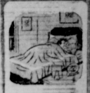
S-S-H, A BURGLAR