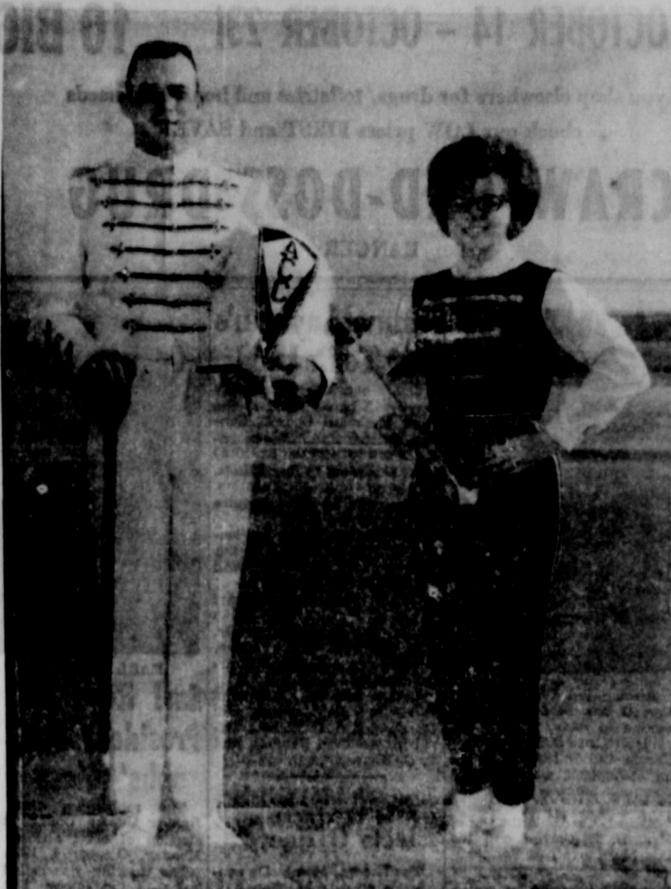
WRANGLERS... (Continued from page 1) Band, bands from the two colleges in the county, as well as the high schools, will form for the parade on East Commerce Street. A Woman's Army Drill Team of Fort Sill, Okla., and the Second Armored Division's Band from Fort Hood also will present outstanding performances as they march in the parade. Added attractions will be the colorful riding clubs, sheriff's posses and numerous float.