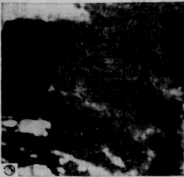
ITALY AT MIDNIGHT... taken from 275 miles up by ITT Laboratories' High-Resolution Infrared Radiometer. The "best" of Italy is at center, with clouds of a weather front at top, over the Alps.

There's a new "eye" for the sky that can reveal long-hidden secrets of Mother Earth. Mounted in a NIMBUS weather satellite whirling busily about our planet, this device, is technically known as a High Resolution Infrared Radiometer. It was designed by the ITT Industrial Laboratories of the International Telephone and Telegraph Company. NASA scientists are elated by its performance. It is predicted that it will offer tremendous benefits to all mankind, providing new means for long range weather forecasting, for geology, for water conservation, and as a tool for extending all the earth sciences. Icebergs, clouds, cities, all give off infrared rays. Now it is possible to "picture" this radiation and chart the daily changes in weather patterns around the world. Infrared study is still in its infancy, but the benefits from it may some day radiate to all mankind.