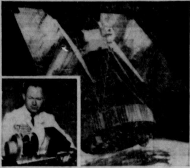
NIMBUS I IN FLIGHT... Artist's rendering shows satellite with earth-oriented High-Resolution Infrared Radiometer attached to bottom. INSET shows ITT Industrial Laboratories' scientist preparing HRIR for installation in NIMBUS I.

There's a new "eye" for the sky that can reveal long-hidden secrets of Mother Earth. Mounted in a NIMBUS weather satellite whirling busily about our planet, this device, is technically known as a High Resolution Infrared Radiometer. It was designed by the ITT Industrial Laboratories of the International Telephone and Telegraph Company. NASA scientists are elated by its performance. It is predicted that it will offer tremendous benefits to all mankind, providing new means for long range weather forecasting, for geology, for water conservation, and as a tool for extending all the earth sciences. Icebergs, clouds, cities, all give off infrared rays. Now it is possible to "picture" this radiation and chart the daily changes in weather patterns around the world. Infrared study is still in its infancy, but the benefits from it may some day radiate to all mankind.