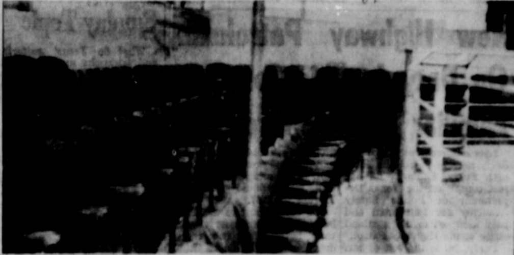
BUYERS' SEATS around ring of Ranger Livestock Commission Co. are shown. The total seating capacity of the arena is more than 200.

chairman of a Masonic Workshop area which includes four counties. Grand Master Hinsley stressed the importance of attendance by all Lodge officers and emphasized that other Masons are welcome.