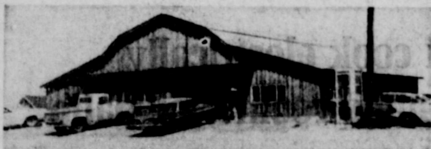
We Are Proud OF OUR NEW, MODERN