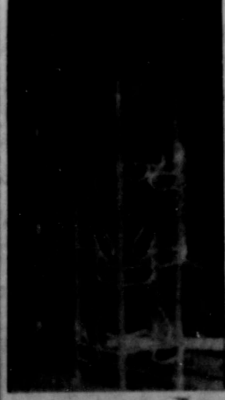
UNIQUE IRON POSTS of western motif adorn the foyer of the new home of the Ranger Livestock Auction Co., Highway 80 east. Horseshoe design was created by Ranger Iron Works.