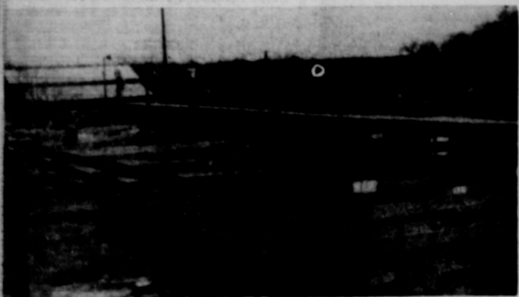
CAMERA'S EYE-VIEW of the stockyards of Ranger Livestock Auction, U. S. Highway 80 east, Ranger. The pens will hold a capacity of more than 2,000 head of cattle.