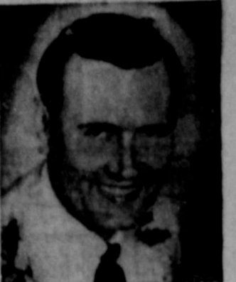
JIMMY C. NEWMAN "King of the Cajons"