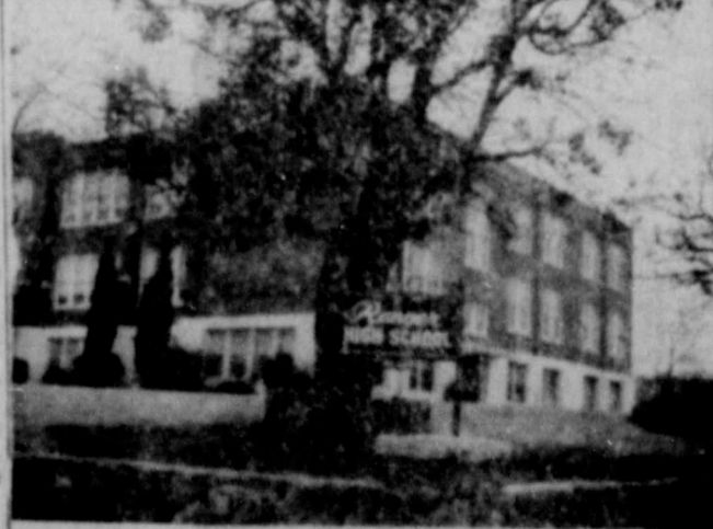
SIGN ABOVE on northeast corner of grounds of Ranger High School was presented as a gift to their alma mater by the Class of 1964.