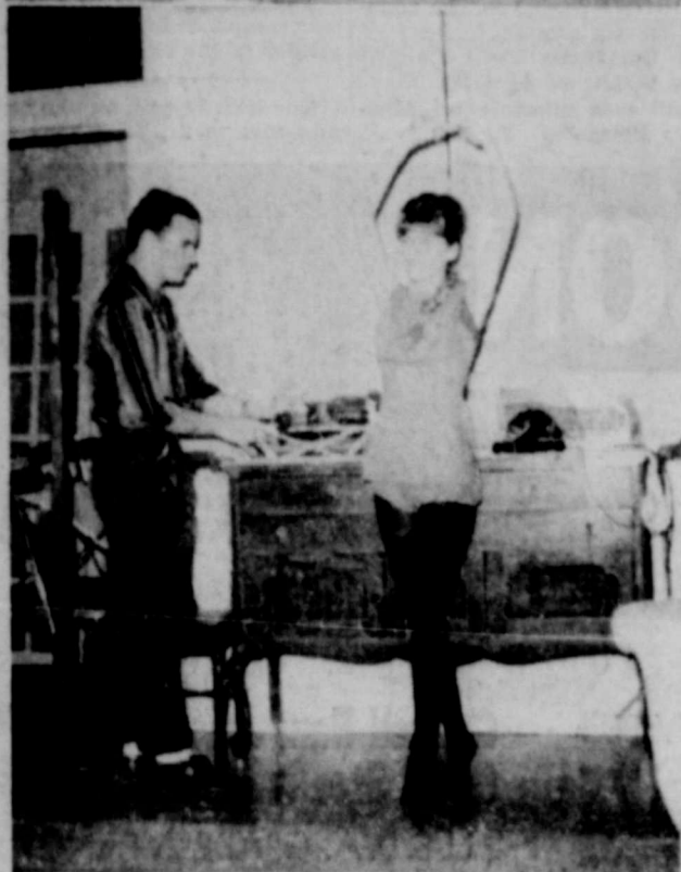
RANGER TIMES Thursday, February 18, 1965 Page Five