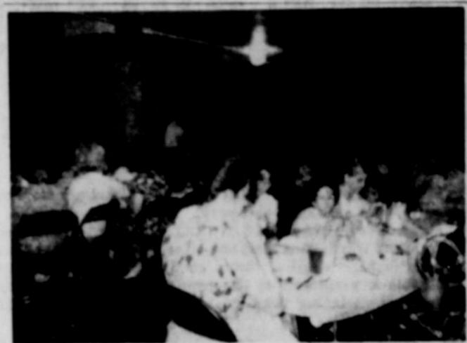
GIRLSTOWN CITIZENS ... Eating Fried Chicken

RANGER TIMES Sunday, August 2, 1964 Page Four