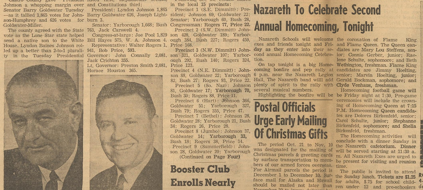
LYNDON B. JOHNSON