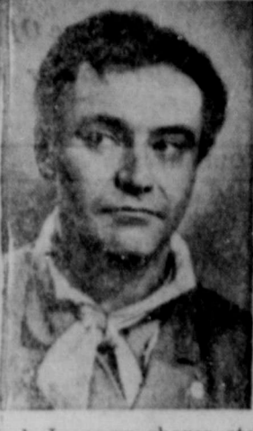
Jack Lemmon shares stellar honors with Shirley MacLaine in Mirisch's Technicolor Panavision comedy for United Artists release "Irma La Douce," opening Sept. 25 at the Majestic Theater.