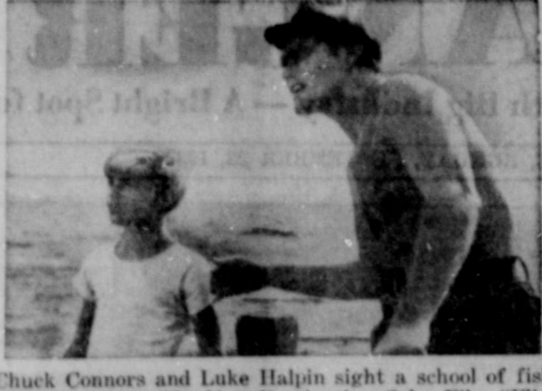
Chuck Connors and Luke Halpin sight a school of fish in a scene from The New Fascinating Color Film "Flipper" showing Sunday thru Tuesday at your Ranger Drive-In Theater.