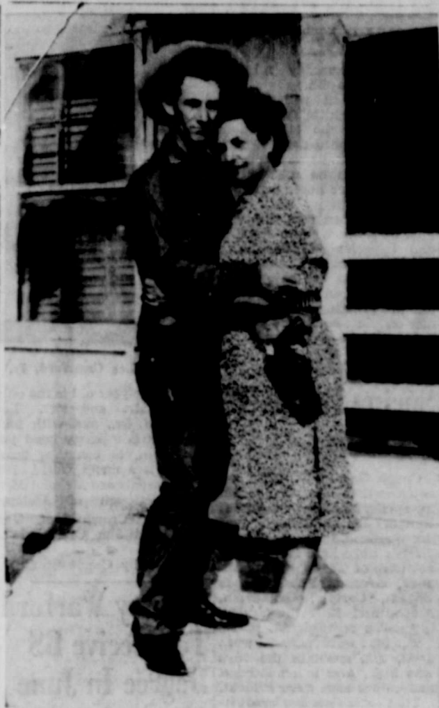
THE LONE RIDER PLUS ONE