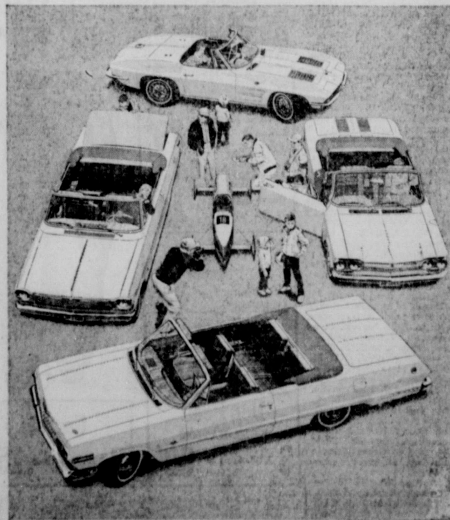
Models shown clockwise: Corvair Sting Ray Convertible, Corvair Monza Spyder Convertible, Chevrolet Impala Super Sport Convertible, Chevy II Monza 400 Super Sport Convertible. Center: Soap Box Derby Racer, built by All-American boys.

NOW SEE WHAT'S NEW AT YOUR CHEVROLET DEALER'S