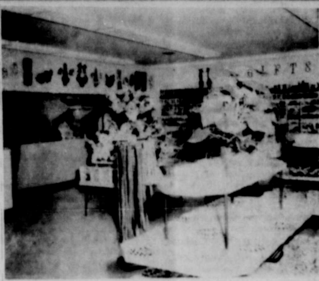
SNACK BAR —The snack bar at Stuckey's Pecan Shoppe is pictured in the background in this photo. Also shown is a portion of the many gift items available at the refreshment center. The refreshment center is celebrating formal opening this Sunday. Free candy is offered to all visitors during open house.