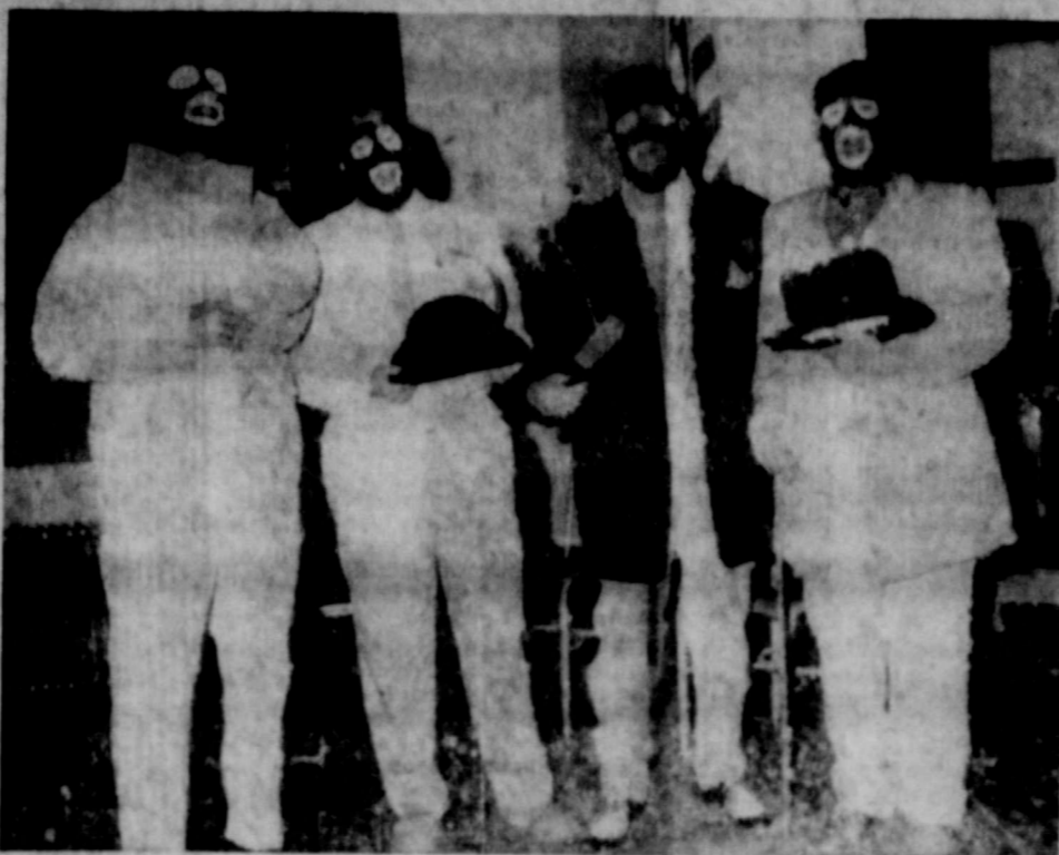
MINSTREL QUARTET—These four men compose a quartet, maybe Barbershop, that you will be hearing if you attend the Lions Club Dark Town Minstrel to be staged Friday and Saturday night.