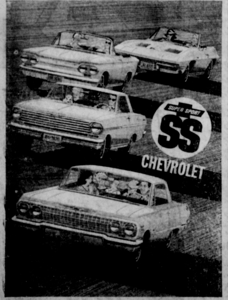
Photos from top to bottom: Corvair Monza Spyder Convertible, Corvair Monza Spyder Convertible, Chevy II Nova 400 SS Coupe, Chevrolet Impala SS Coupe. (Super Sport and Spyder equipment optional at extra cost.)

NOW SEE WHAT'S NEW AT YOUR CHEVROLET DEALER'S SUPER SPORTS —that's the only name for them! Four entirely different kinds of cars to choose from, including bucket-seat convertibles and coupes. And most every one can be matched with such sports-car type features* as 4-speed stick or Powerglide transmission, Powerbrake, tachometer, high performance engine, you name it. If you want your spice plus the luxuries of a full-sized family car, try the Chevrolet Impala SS. It's one of the smoothest road runners that ever teamed up with a pair of bucket seats. It even offers a new Comfortilt steering wheel* that positions right where you want it. ■ The new Chevy II Nova SS has its own brand of excitement. Likewise the turbo-supercharged rear-engine Corvair Monza Spyder and the all-new Corvette Sting Rays. Just decide how sporty you want to get, then pick your equipment and power—up to 425 hp in the Chevrolet SS, including the popular Turbo-Fire 409* with 340 hp for smooth, responsive handling in city traffic. *optional at extra cost