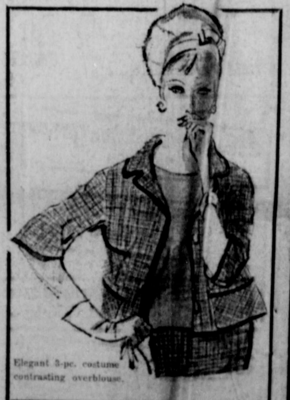
Elegant 3-pc. costume contrasting overblouse.

Bright colors and light fabrics are setting the stage for Easter's coming parade of spring fashions... see them all now in our new collection of coats, dresses and suits.