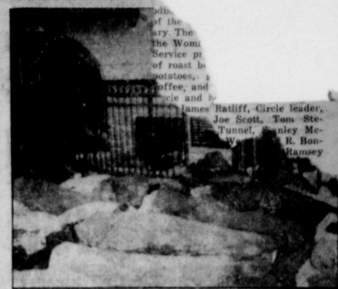
NECESSARY—Haven by the trackside is not as pleasant as a stretch of beach on the Riviera, but it is a welcome refuge from the bitter cold of a worst-in-years winter in Europe. City officials of Paris, France, have made closed-down subway stations available as sleeping quarters for itinerants and the homeless of the city.

Weather Reports Fair, with little change in temperature Sunday. High Saturday 53, low Saturday night 38, high Sunday in the mid-50's.