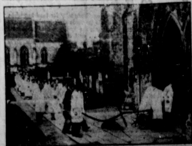
PROVIDENCE GUIDES THE PLOW—Seeking God's blessing on the spring crops, residents of Chichester, England, bring a plow to church for a symbolic blessing by the Bishop of Chichester Cathedral. The custom, dating back to the 17th Century, is now an annual affair.

Mr. Webb said that the new auto tags will have a prefix of C-S and C-R. The C-S prefix will have numbers from 10 to 5799 and the C-R (Continued On Page Two)