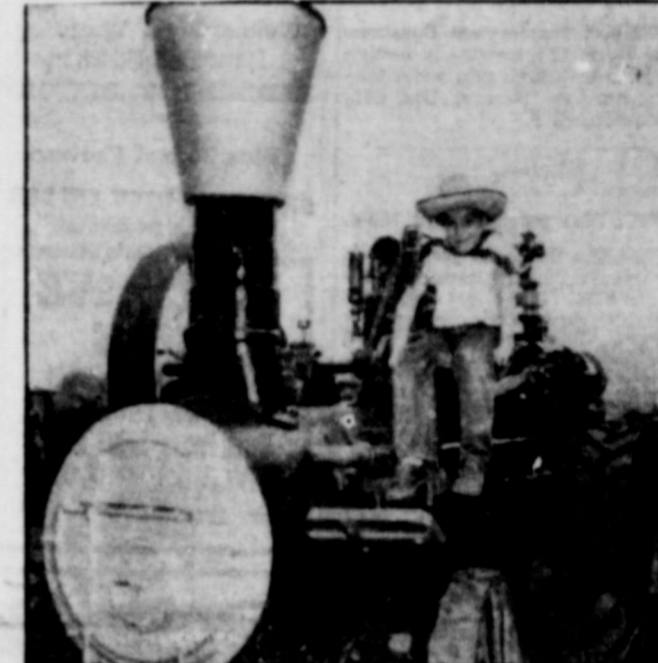
PRAIRIE EXPRESS—Tommy Lightner, 4, youngest member of the Midwest Old Settlers and Threshers Association meeting at Mount Pleasant, Iowa, rides a 68-year-old Case steam engine, one of 26 ancient workhorses which once powered threshing equipment on farms. The old-time puffers were brought from various parts of the midwest for entry in a horsepower contest.

The group requested that the commissioners make a formal application to the State Highway Commission asking that the road be developed into a Farm-Market Road.