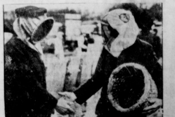
AND NO ONE GOT "STUNG"—They need protection against their temperamental "product"—bees— but dealers in the ill-tempered retractor-gatherers find a handshake sufficient to seal a bargain for the swarm held by the well-protected man at right. The transaction was made during the holding of the annual Bee Market in Veenendaal, Holland, one of the "buzziest" affairs of its kind in the world.