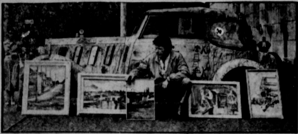
HE'S A REAL "CAR"TOONIST—This touring Italian artist has turned his auto into an advertising sign for his wares. He pauses in the Piazza Cavour, Milan, Italy, to sell a few paintings before resuming his gypsy-like trek across the countryside.