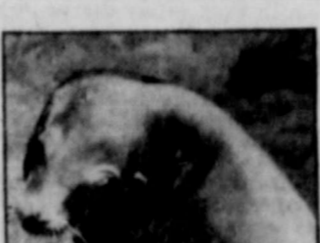
UH-HUH? HUH-UH!—Baby Sea Lion wants to head for the deep end of the pool, but Mama says "nothing doing." There'll be no shennigans on Seal Island in the London, England, zoo if she can help it.

He is a mechanic in the battalion, part of the 32d AAA Brigade, which engages in joint training exercises with the U. S. and Royal Air Forces and the British Army.