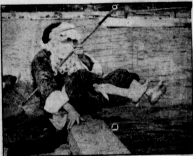
TOO HOT FOR SANTA — Dunder and Blitzen, heat-struck, veered way off their course and deposited Santa Claus in Chicago, Ill., right in the middle of a heat wave. While the deer are recuperating at an air-conditioned animal refuge, Santa spends his time fishing in Lake Michigan.