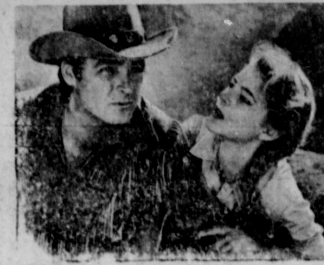
Rory Calhoun and Peggie Castle in a scene from "The Yellow Tomahawk" filmed in beautiful color playing Sunday and Monday at your Tower Theatre.