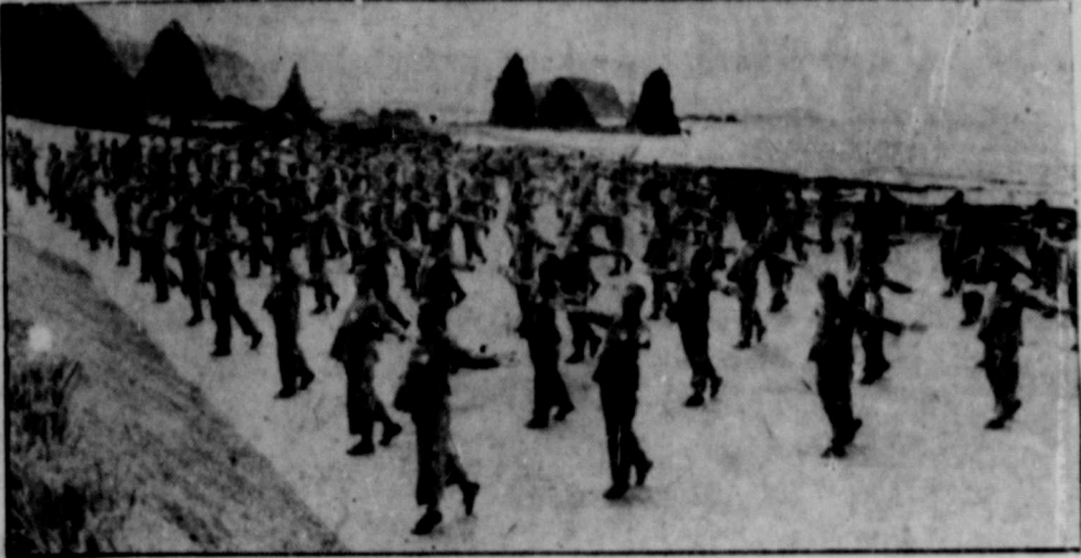
"EMBRACING" WESTERN IDEAS—Some of the 1450 political prisoners of Nationalist China throw their arms wide during morning exercises on their prison island off the coast of Formosa. The detention camp, known as "Home of the Reborn," houses the one-time Communists, suspected Communists, and fellow-travelers until their political re-education is completed.