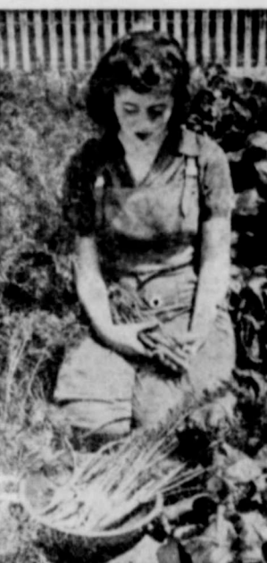
Young Carrots From Your Garden Taste Different!

If home garden crops were to be rated according to the quantity of vitamins they contribute to the family diet all season long, the carrot would probably be rated next to the tomato.