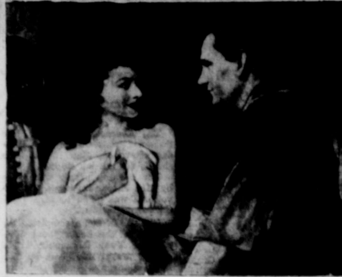
Dramatic scene from "Laughing Anne" pictures co-stars Margaret Lockwood and Ronald Shiner. The brilliant Technicolor production coming Tuesday and Wednesday to the Tower Theatre, also stars Wendell Corey and Forrest Tucker.

Used Car—Be Sure to See Your Ford Dealer