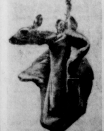
REAL FAWN—This baby deer peering out of a bulg bag looks unhappy, but he's among friends. He is one of the many "bagged" annually at the Cus-sino, Mich., Wildlife Station, where scientists are conducting experiments.

The occupants were away at the time of the fire.