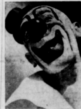
Top Kick Clown

Kelly - Miller moves on 65 new steel semi-trailer trucks, employs