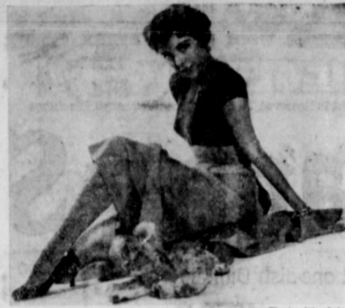
Betsy Von Furstenburg, Franchot Tone in the comedy hit, "Oh, Men! Oh, Women!," has won the cover position on the March issue of Theatre Arts Magazine.