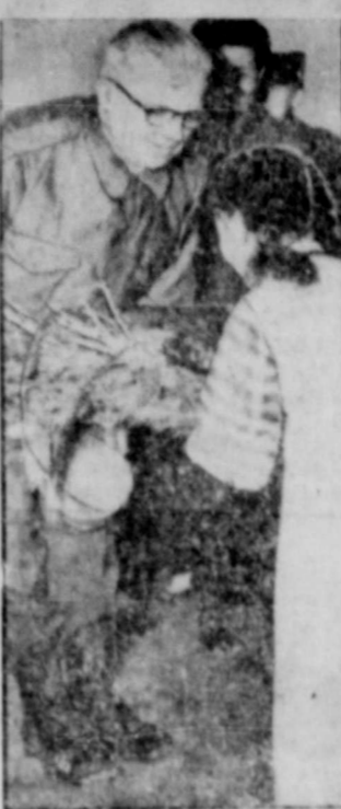
BOW FOR BOUQUET—U. S. Secretary of the Army Robert Stevens executes an Oriental-type bow as he accepts a bouquet from a young Korean girl. Stevens was on hand for the ground-breaking ceremony for a new Seoul orphanage sponsored by the U. S. 8th Army.