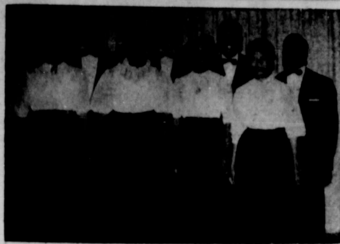
Terrell Texas Singers To Appear Here