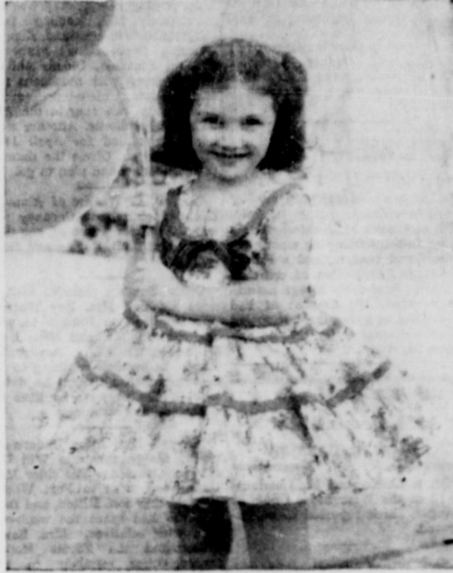
Bright little figures—made all the brighter by the white background of the fabric—pattern a novelty "Seersucker" used for a one-piece Prissy Missy dress by Westway of Dallas. Contrasting bands accent the full tiered skirt and neckline of the bodice. White/grey/gold, white/aqua/luggage, white/grey/green. Sizes 3-6. Retail about $4.00. Style #D-2100.