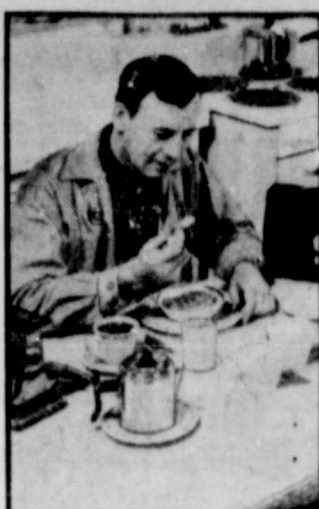
Agriculture Secretary Ezra Taft Benson's cut of supports on dairy products from 90 to 75 per cent of parity have divided both Parties, some congressmen claiming the cut will help consumers more than dairymen.