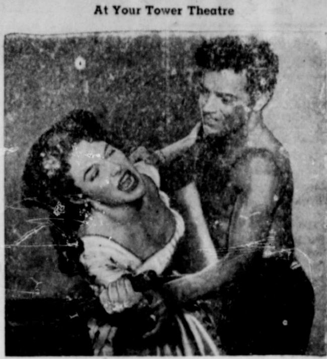
At Your Tower Theatre

Muscular Cornel Wilde contains hot tempered Anne Bancroft as she attempts to strike him in this scene from "Treasure of the Golden Condor," new Twentieth Century-Fox Technicolor drama at the Tower Theatre Sunday and Monday.