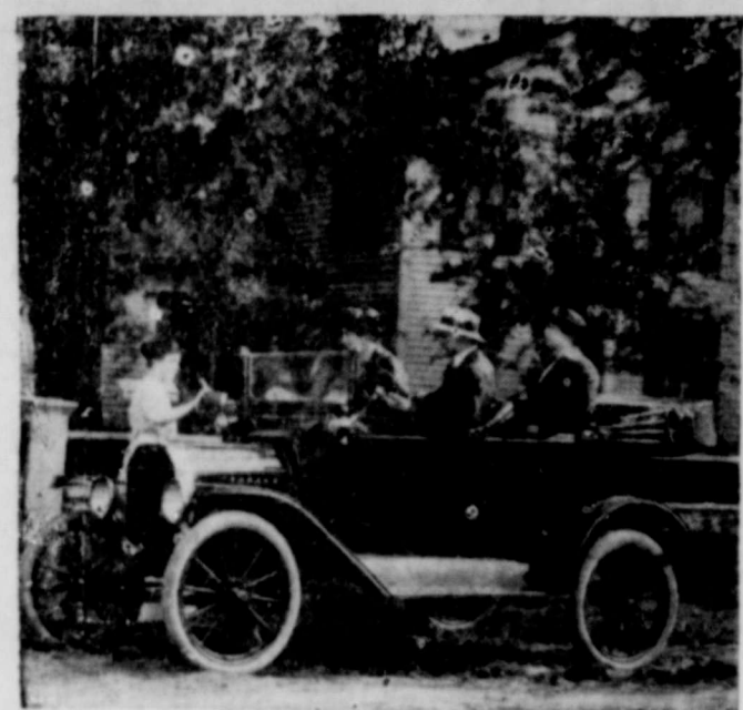
The Model T was born Oct. 1, 1908, and when the last of more than 15,000,000 was produced 19 years later it had become the most famous car in history. Henry Ford's specifications were simple: the T was easy to operate and repair, low priced and durable.