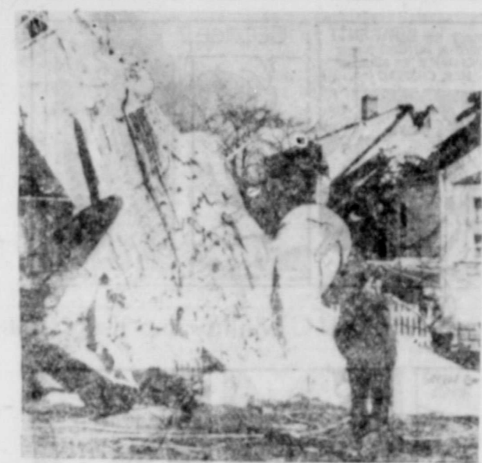
THEY WALKED AWAY FROM THIS ONE—The crew of this Navy PBV were unhurt when the ship's two engines failed and it hit two houses as it approached the Severn River Naval Command field, near Annapolis. Occupants of the houses were uninjured.

The Bureau of Labor Statistics (BLS) which gathers the monthly prices used to compute the index, said all major items making up the "market basket" of consumer expenditures dropped over the month except housing and personal care—which includes such items as haircuts, manicures and the like. These rose, but only slightly.