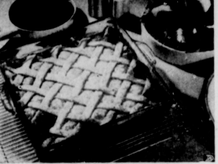
Here is a flavorful, colorful, meal-in-a-dish—just the thing to please the end of the month food budget.

Temp't family appetites with this Cheese Crusted Hamburger Pie early this spring. You may be surprised yourself at how your family will accept a new dish so quickly—and demand repeats in the future.