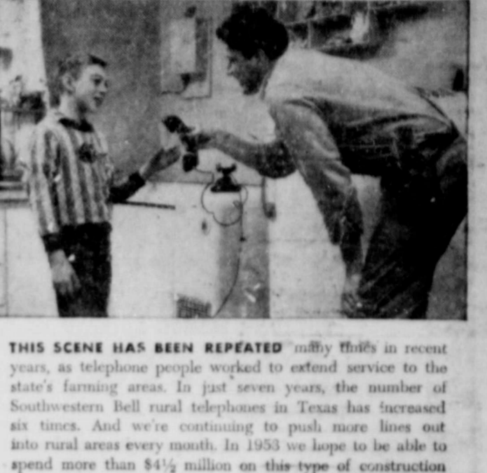
THIS SCENE HAS BEEN REPEATED many times in recent years, as telephone people worked to extend service to the state's farming areas. In just seven years, the number of Southwestern Bell rural telephones in Texas has increased six times. And we're continuing to push more lines out into rural areas every month. In 1953 we hope to be able to spend more than $4½ million on this type of construction alone. SOUTHWESTERN BELL... A TEAM OF 20,000 TEXANS... PARTNERS IN TEXAS' PROGRESS.