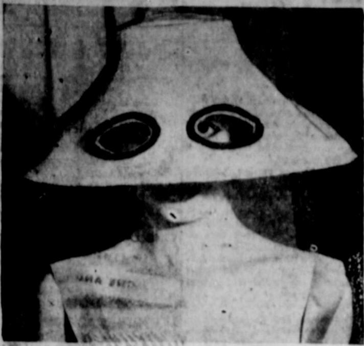
PEEK-ABOO HAT—If you like privacy and still want to catch men's attention, Parisian designer Jacques Heim has created this