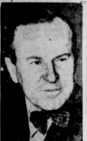
NEW UN CHIEF?—Lester B. Pearson, Canadian Secretary of State for External Affairs, may replace Trygve Lie as UN Secretary General. Secretary Lie has long been in the bad books of the Russians, but they have indicated they would accept Pearson for the job. At present he is President of the UN General Assembly.

In horse racing, all the swamis are in the grandstand.