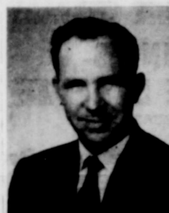
DR. CALVIN W. HARRIS He'll Be Candidate For Mayor on April 7

Exit Shop at 207 S. Rusk, became the city water commissioner in May, 1949, and points out that during his administration many bottlenecks have been taken out of the local water distribution system, thousands of feet of city water and sewage lines. He estimates that expansion of the Ranger sewage system alone has eliminated more than 200 outside toilets.