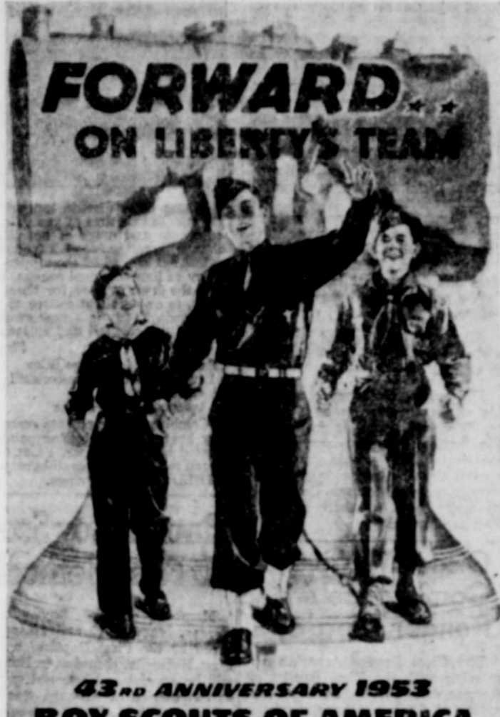
43rd ANNIVERSARY 1953 BOY SCOUTS OF AMERICA