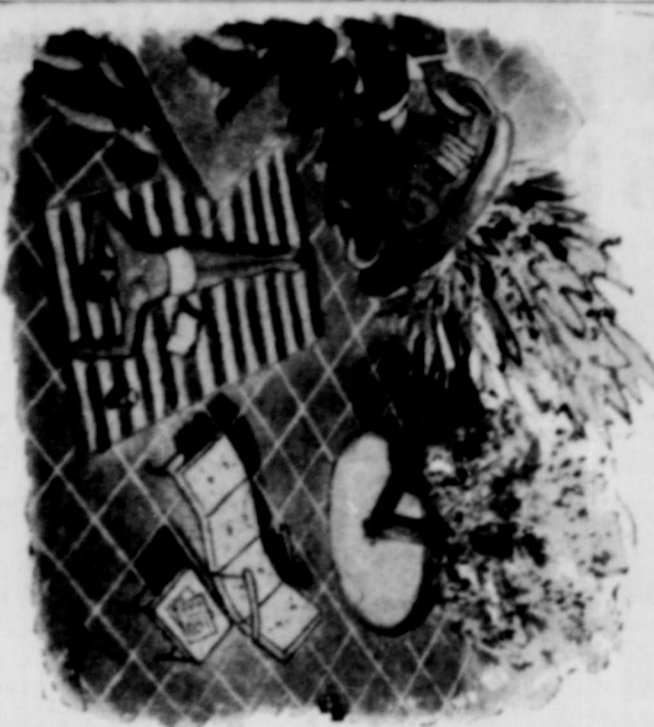
I was almost asleep when the pot came crashing down... one of two janitors that stood on the falling of a baloney.