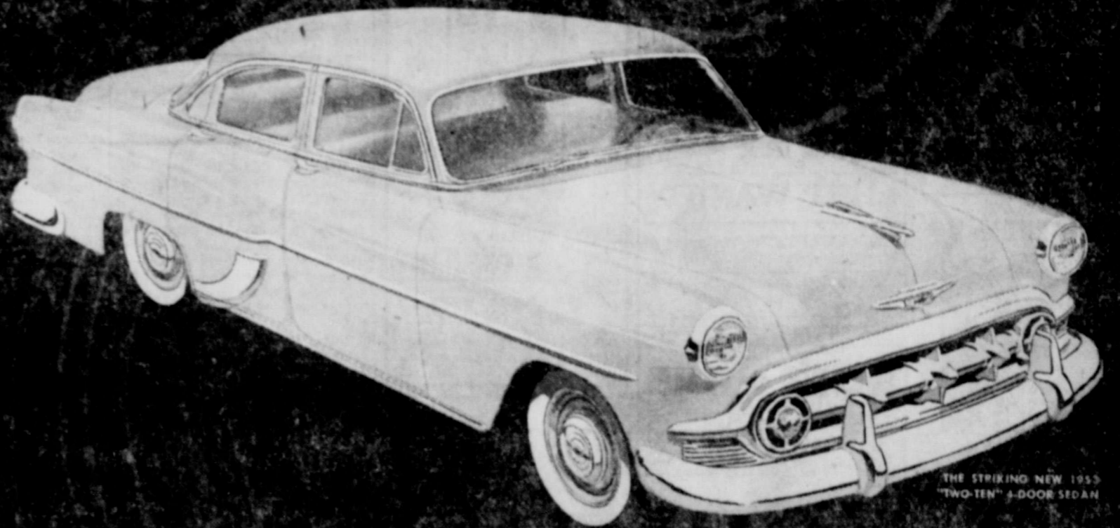
THE STRIKING NEW 1953 "TWO-TEN" 4-DOOR SEDAN

So startlingly new! So wonderfully different!