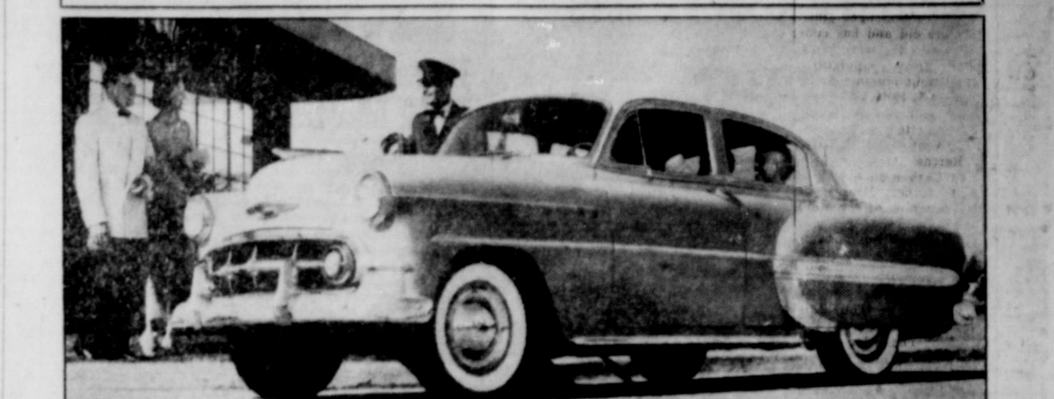
The Bel Air four-door sedan is one of four body types with which Chevrolet pioneers a completely new series of passenger cars for 1953. Richness in exterior and interior appointments gives the series a distinction never previously achieved in the Chevrolet market.