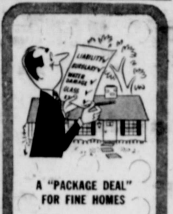
A "PACKAGE DEAL" FOR FINE HOMES