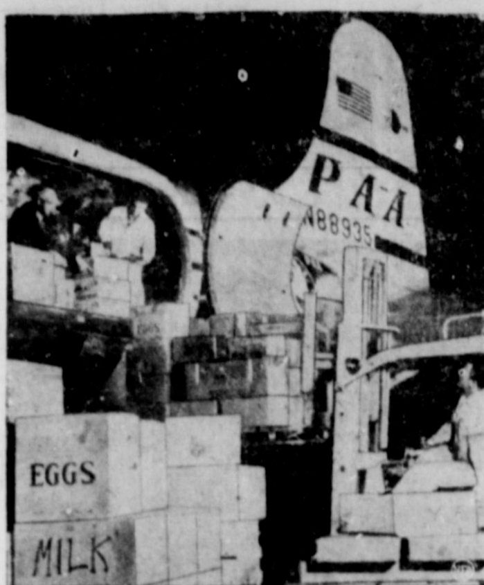
GROCERY AIRLIFT FOR ALASKA—Pending settlement of the West Coast maritime strike, groceries are being airlifted to Alaskan communities dependent on shipping for their supplies. Nome and Fairbanks are among the communities hit by the month-old strike.