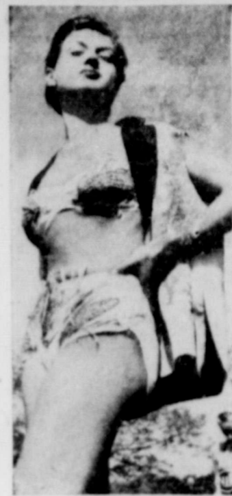
CORNY, BUT NICE — Kay Goudron, of Rome, models a corn-decorated bathing suit, designed by Gasberri, one of Italy's foremost stylists. The kernels of corn are the real thing, and on hot days may keep things popping on the beaches.

By United Press FORT WORTH, July 5 (UP)—USDA-Weekly livestock: Cattle compared last Friday: Slaughter steers and yearlings weak to 50 lower, some low grade grassy offerings 1.00 off, cows weak to 50 lower, bulls steady, best stockers steady, others dull and weak to lower. Week's top: Slaughter steers prime 694 lb. mixed yearlings 34, cows 21, bulls 23.50 stocker over yearlings 26. Calves: Compared last Friday: Steady to 1.00 lower. Good and choice slaughter calves 26-30, few prime early 31-31.50, utility and commercial 17-25, culls 14-16, good and choice stockers 27-31, top 32, common and medium 18-26. Sheep: Compared last Friday: Slaughter spring lambs 1.00-2.00 higher. Slaughter yearlings and ewes strong to 50 higher, feeder lambs 1.00 higher, feeder yearlings strong. Week's tops: slaughter spring lambs 28, slaughter yearlings 15, slaughter ewes 7, feeder lambs 18.50, feeder yearlings 14.50. Hogs: Compared last Friday: Butchers 25 higher, sows and pigs steady. Week's tops: Butchers 21, sows 16.50, feeder pigs 16.