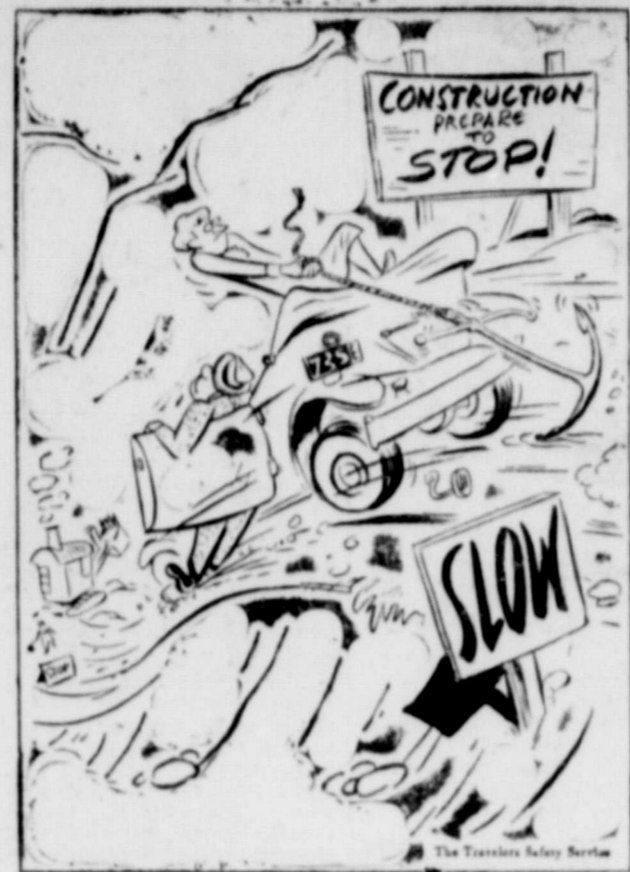
Lucky you—you cheated the undertaker with your broken down car