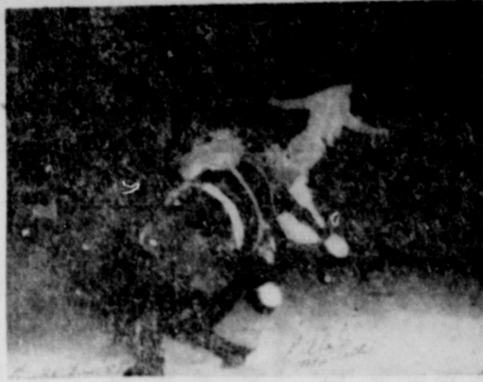
"SWAN DIVE"—Some unlucky cowboy is shown making a perfect swan dive off "Clodbuster" one of the feature Bucking Horses of the Lone Star Ranch Rodeo, to be held at Baird Rodeo, May 1-2-3.

MEMBER—United Press Association, NEA Newspaper Feature Association, Texas Daily Press League, Southern Newspaper Publishers Association.