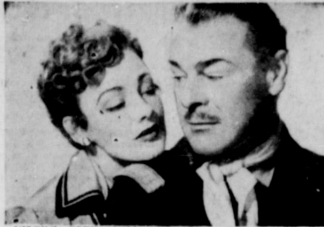
VIRGINIA GREY and BRIAN DONLEVY in a romantic scene from RKO's "SLAUGHTER TRAIL," in color by Cinecolor.