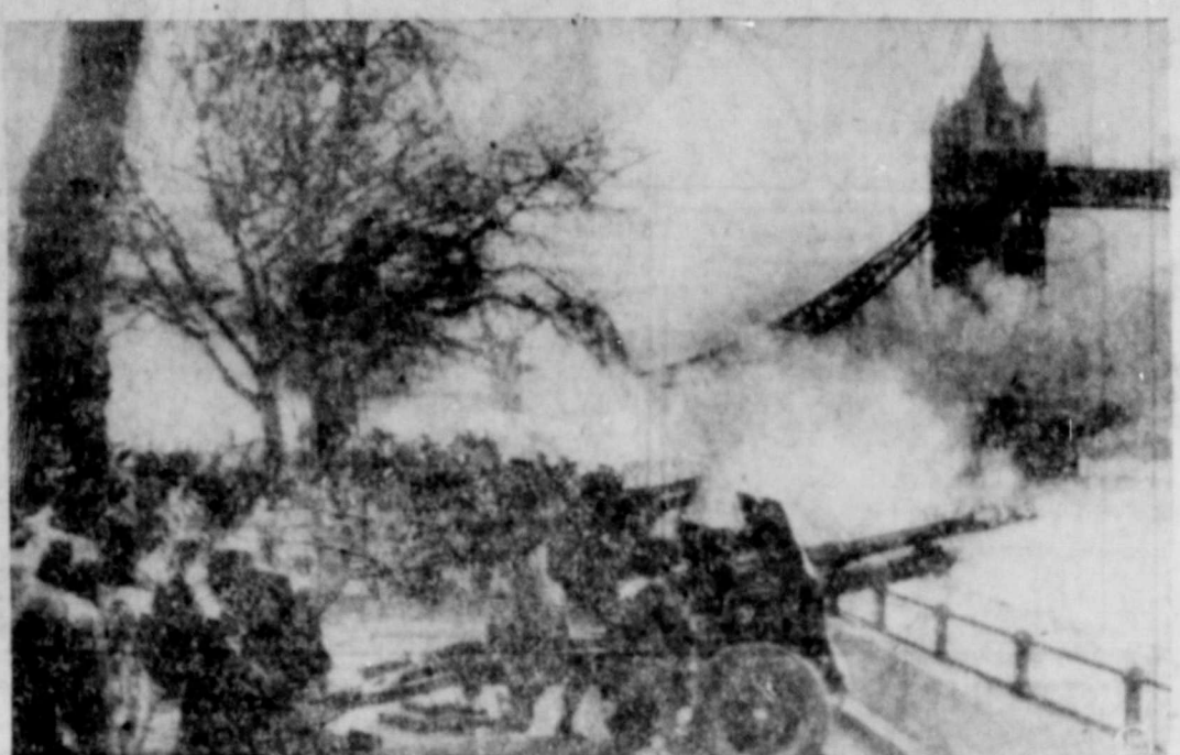
SALUTE FOR THE KING —As the British Troopers fighting for the Kingdom in Korea fired a 101 round live ammunition salute into communist positions in honor of their dead king, George VI, the Kings Troop Royal Horse Artillery fires a 56 gun salute in Hyde Park in London, one for each year of the King's life.

For Good Used Cars (Trade-in on the New Olds) Osborne Motor Company, Eastland