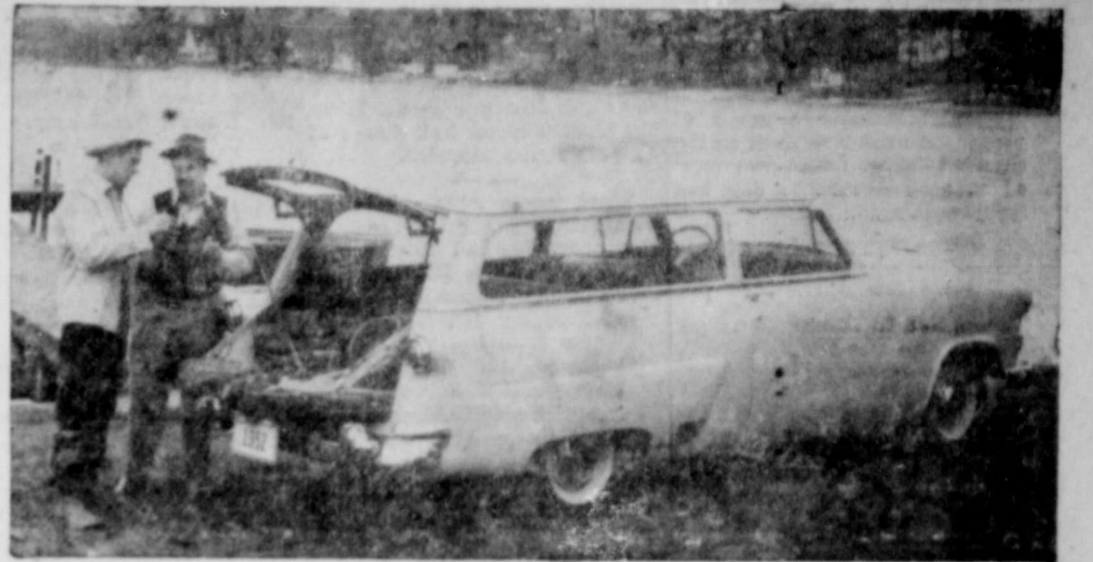
The 1952 Ford Mainline "Ranch Wagon" is a six-passenger utility vehicle for business or pleasure, in city or country. It has passenger car styling and station wagon conveniences, plus six power combinations. The Ranch Wagon is available with the Ford Mileage Maker Six or Strato-Star V-8 engine with a choice of the conventional transmission, Ford overdrive or Fordomatic—Ford's automatic transmission.