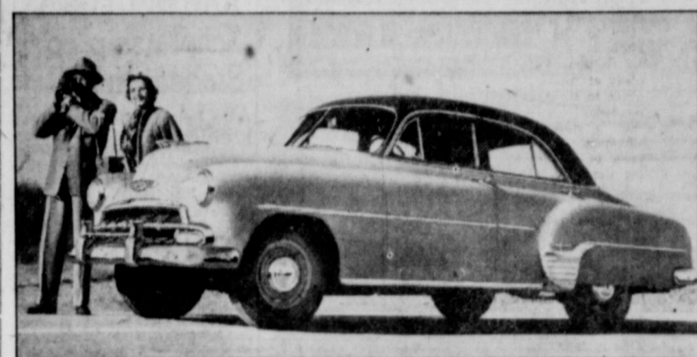
Chevrolet records indicate the four-door Styleline De Luxe sedan was the most popular body model in the country in 1951. Above, it is shown in its 1952 design, more striking in appearance and improved in performance over earlier models. Headlining some notable contributions to motoring pleasure are smoother riding qualities and responsive performance under all sorts of weather conditions.