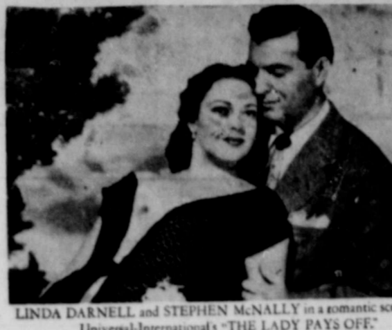
LINDA DARNELL and STEPHEN McNALLY in a romantic scene from Universal-Internationals' 'THE LADY PAYS OFF.'