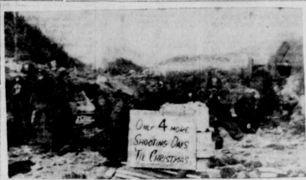
CHRISTMAS REMINDER —Gunners of the 424th Field Artillery in Korea, send their Christmas greetings to the Reds, as their 8-inch Howitzer speaks its piece. In the foreground, sign reminds the gunners that now is the time to shop for dead Reds.