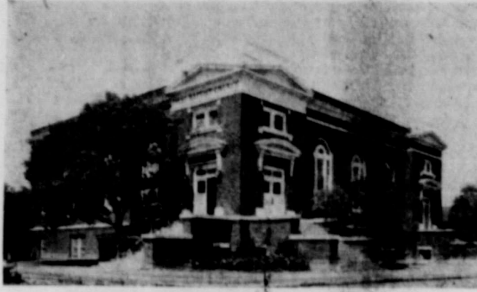
FIRST BAPTIST CHURCH Walnut at Marston