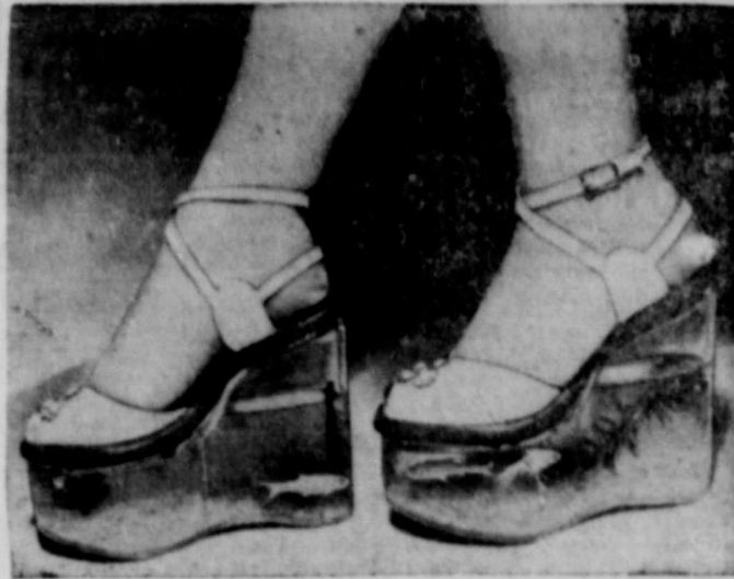
CINDERELLA WAS A PIKER —Real, live goldfish swim around in these glass slippers displayed by a manufacturer at the National Shoe Convention in Chicago. You won't be able to rush right out and buy a pair, though, as the maker, who calls them "Floating Steppers," doesn't plan to put them on the market.

wood productions. To help meet the composition, Japanese studios have combined the old with the new. In some films they have the ever-popular sword fighting done by the newly-popular strip-show chorus girls. A new resin-based, fire-retarding treatment for fabrics retains its flame resistance through 25 or more dry cleanings or washings but does not change the appearance or feel of the fabric. St. Louis, Mo., is limited to an area of 81 square miles.