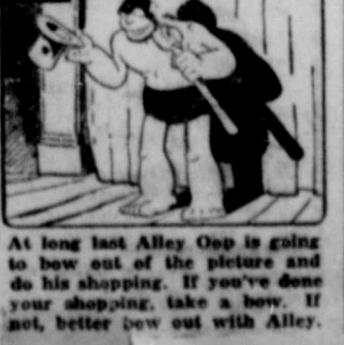
At long last Alley Oop is going to have out of the picture and do his shopping. If you've done your shopping, take a bow. If not, better bow out with Alley.