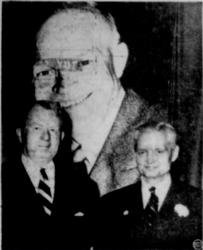
PLANS FOR PRESIDENTIAL PRIMARY —Supporters of Gen. Dwight D. Eisenhower held their first New Hampshire rally at Manchester, N. H. in preparation for the State's first-in-the-nation presidential primary next March. Standing in front of the framed General's picture are Gov. Sherman Adams of N.H., left, and Sen. James H. Duff of Penn., who addressed the rally.