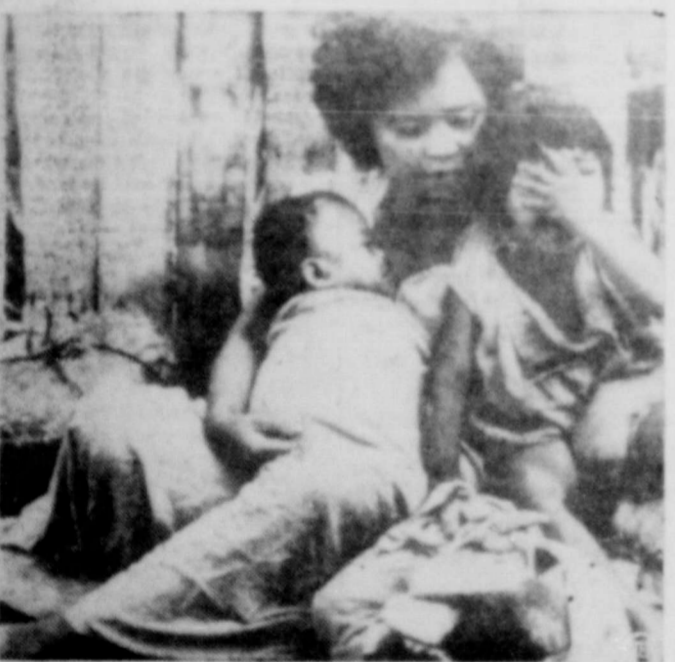
FLEE DESTRUCTIVE VALCANO —A young Camiguin Island mother and her children rest after their flight from Mambajao to Mindanao, Philippine Islands—fleeing the wrath of the volcano Hibok-Hibok.