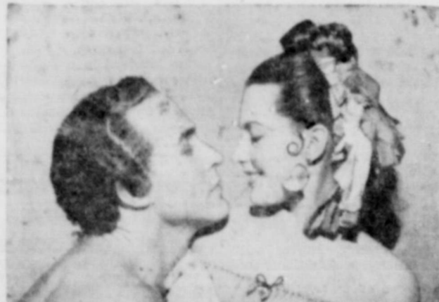
Ricardo MONTALBAN and Gyd CHARISSE in a scene from Universal-International's "MARK OF THE RENEGADE" Technicolor.