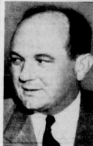
RUSK TO QUIT? —Washington reports say Dean Rusk, assistant Secretary of State for Far Eastern affairs, above, is expected to resign soon to take a position in private enterprise. The State Department declined to comment on it, but Rusk's associates said they wouldn't be surprised if he left government service for the higher pay and greater calm of private life.

ATTEND THE CHURCH OF YOUR CHOICE EVERY SUNDAY READ THE CLASSIFIEDS