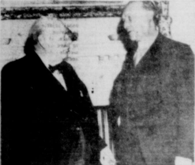
FRIENDLY CHAT —Prime Minister Winston Churchill, left, and West German Chancellor Dr. Conrad Adenauer sat during the latter's visit to London, England. Dr. Adenauer seeks to restore amicable relations between Germany and Britain.