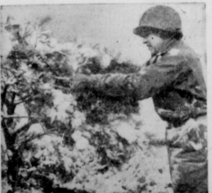
IN THE YULETIDE TRADITION...—War or no war, Christmas is coming, even at the front lines in Korea. Here, an unidentified G.I. near the front cuts a snow-covered evergreen that he will use as a Christmas tree.