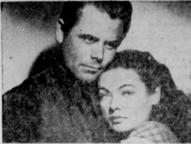
GLENN FORD and GENE TIERNEY find love, in this scene from 20th Century-Fox's 'THE SECRET OF CONVICT LAKE.'