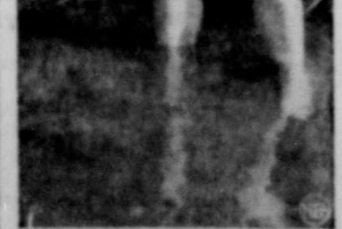
KOREAN CLEAN-UP - With his camera and towel and nothing else, Bert Ashworth, NEA-Acme staff photographer covering the Korean war, takes time out to cool off a bit in a shallow stream.