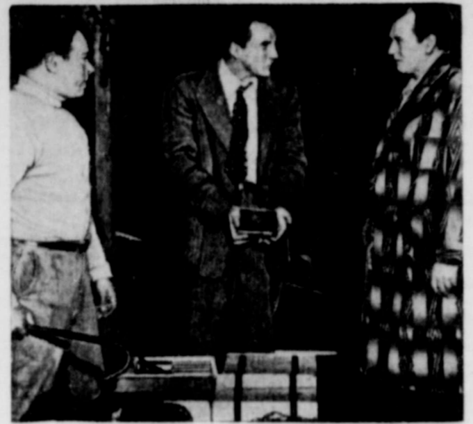
A scene from Columbia's new sea drama "Smuggler's Gold" starring Cameron Mitchell.